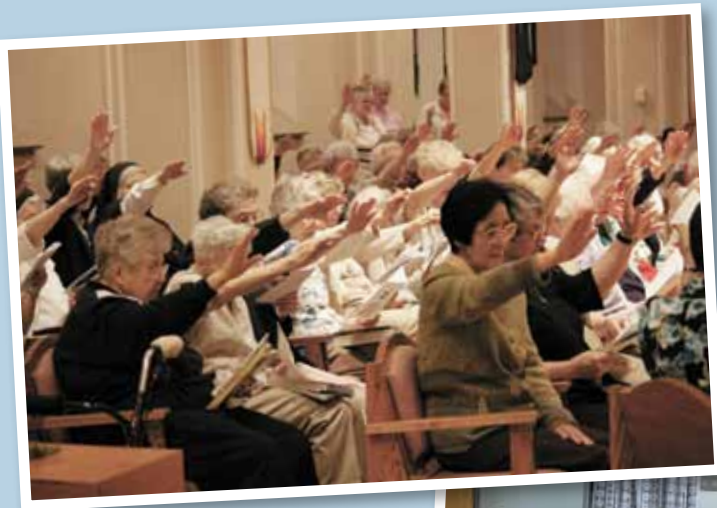
Sisters from the former St. Louis Province bestow a blessing during a Mass to celebrate the outgoing council members. St. Louis is now part of the new Central Pacific Province.

of School Sisters of Notre Dame in Prayer, Ministry and Community