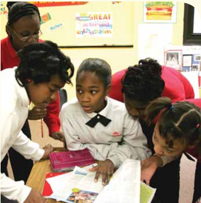
Students discuss a team project in a fifth-grade social studies class at Sisters Academy in Baltimore.