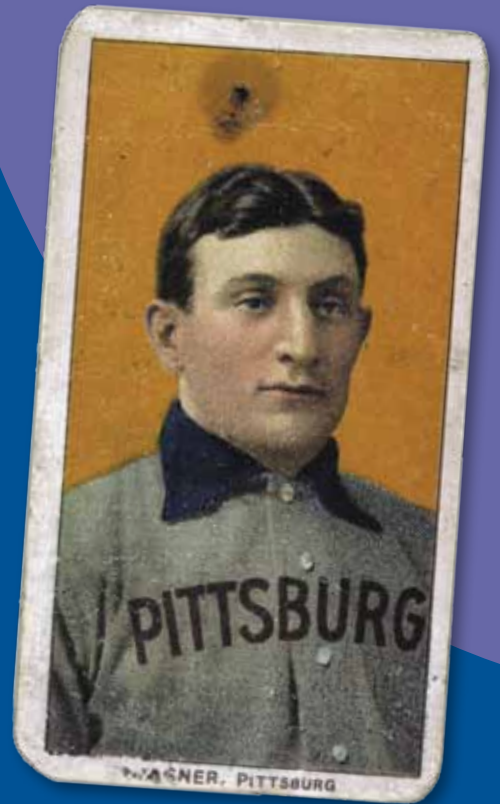
A rare Honus Wagner baseball card similar to this one was bequeathed to the School Sisters of Notre Dame.

Your prayerful support, financial contributions and encouragement help us to carry forward the mission that Blessed Theresa Gerhardinger started nearly 180 years ago. Together, we are making a difference.