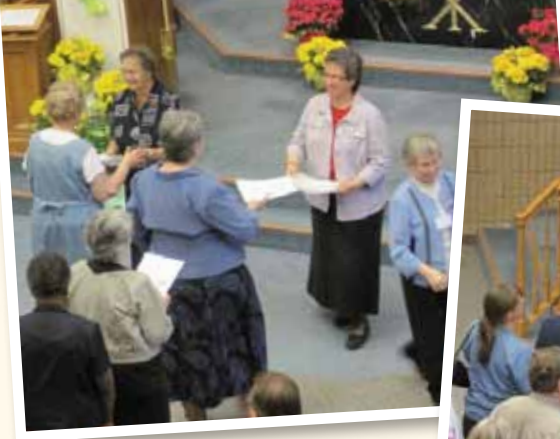
Associates participate in a recovenanting ceremony at Notre Dame of Elm Grove.