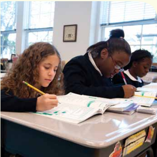
Sixth-grade girls at Mother Seton Academy in Baltimore work on an in-class assignment in English grammar. Academics are taught in single-sex classes, but elective subjects, such as music, chorus and art, are often co-ed.

NativityMiguel schools seek to offer a holistic education, addressing the spiritual, moral and emotional development of students as well as academic, physical and social needs. For the most part, the schools are community-based, reflecting the racial and cultural makeup of the neighborhoods they serve. Classes are small, allowing for individual attention, and the school day is long, stretching