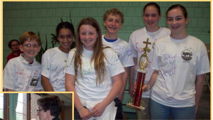
Above: Students from St. Paul's School in Genesee Depot, Wis., display their second place trophy.

This year, more than 200 students came to TYME OUT over two days to play a series of games that help them learn their faith facts. School Sisters of Notre Dame help lead the games.