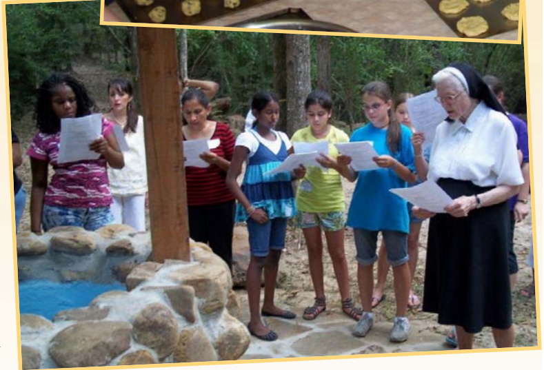
Mothers and daughters pray at the well at St. Mary of the Pines in Mississippi.